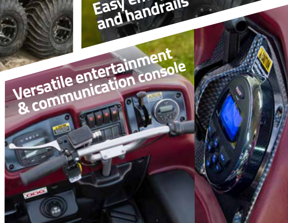
Versatile entertainment & communication console