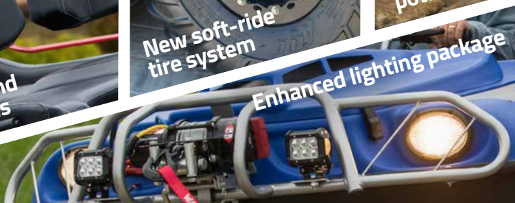
Enhanced lighting package