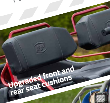
Upgraded front and rear seat cushions