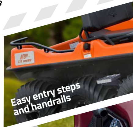
Easy entry steps and handrails