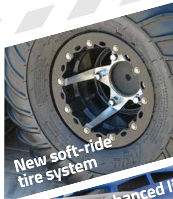
New soft-ride tire system