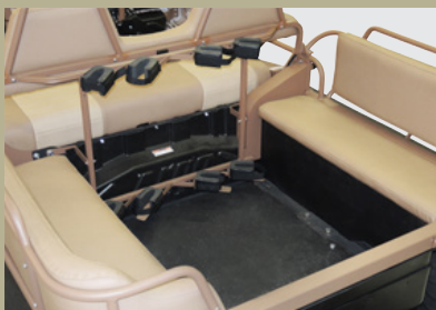
Uniform front and rear floor for sure-footed entry