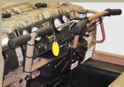
Heated hand grips (passenger & driver)