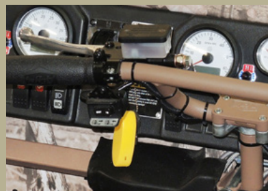
Innovative gauge design plus 12v USB power outlet