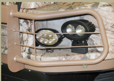
Enhanced lighting package