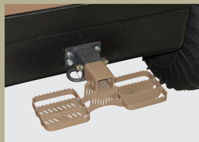
Dual entry step