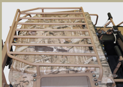
Heavy duty hood rack