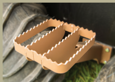
Right and left entry step