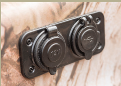
12V / USB power outlet