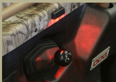
Interior lighting package