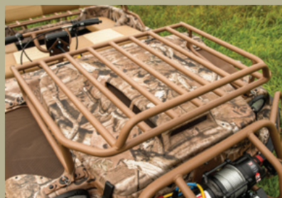
Heavy duty hood rack