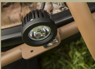
Enhanced exterior lighting package