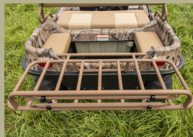
2-position, fold down, storage rack