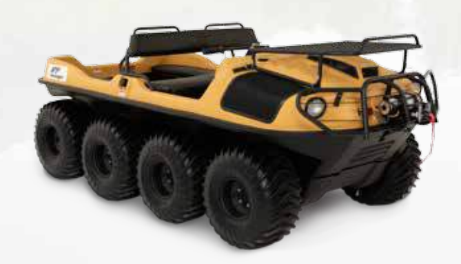
The Avenger Pro 800 XT 8x8 includes a front rack and comes in Industrial Yellow or Green.

The Avenger Pro 800 XT Responder 8x8 offers a rear winch receiver kit and comes in Red or Orange. Vehicle shown with optional rescue accessories.