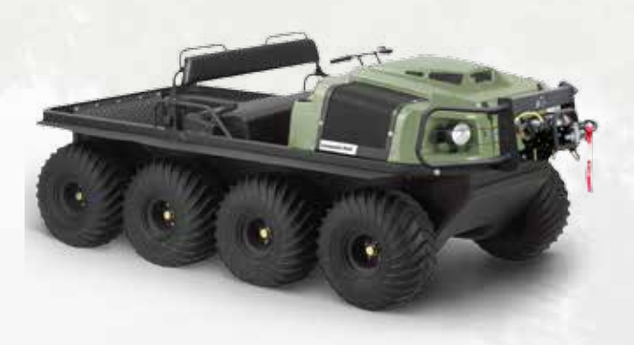
The Conquest Pro 800 XT 8x8 comes with a rear winch receiver kit and is available in Industrial Yellow or Green.