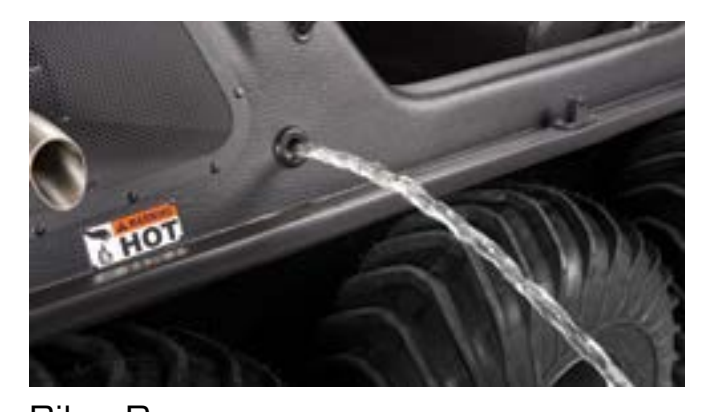
Bilge Pump A built-in bilge pump quickly and effectively evacuates water that enters an ARGO XTV.

Bigfoot come equipped with a 3500-LB WARN Winch for the ultimate in utility, ease-of-use and durability. The winch is conveniently operated via an on-dash actuator. .