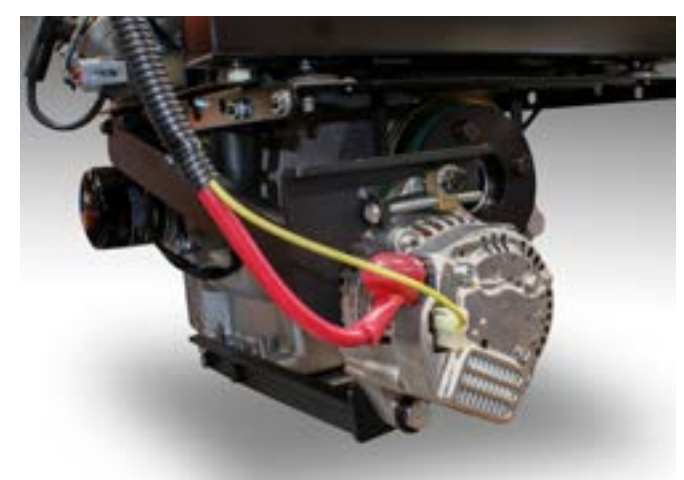
Alternator Commerical grade alternator 60 amp standard on the 800 models and 50 amp on 950 models.

4500-Pound WARN Winch Conquest come equipped with a mighty 4500-LB WARN Winch for the ultimate in utility, ease-of-use and durability. The winch is conveniently operated via an on-dash actuator.