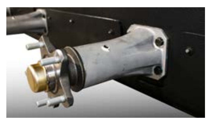
Heavy Duty Axle Heavy duty 1.5" forged axles in oil bathed reinforced housings.