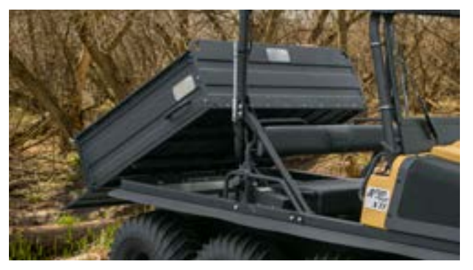
Power Dump Box The XT-X solid steel Power Dump Box can move bulk loads up to 1,000 lbs (450 kg).