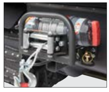
Winch Mount-Rear Receiver Allows winch to be placed at the rear of the vehicle. Comes complete with quick-disconnect wiring.

(Not shown) Designed to accept a 2,040 kg (4,500 lb) winch. Modifications may be required to accept a non-WARN winch installation.