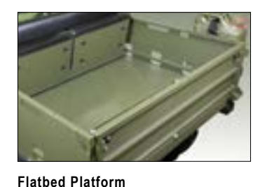
167.6 cm wide x 111.5 cm long (66" W x 44" L). Mounts to the main chassis and is supported by the upper frame to provide a large area for cargo and equipment transportation. Includes 4 tie down points and a 81 cm wide x 89 cm long (32"W x 35"L) hatch for easy access to lower body cargo area.