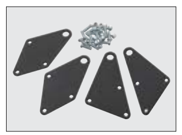
Helicopter Sling Load Kit Axle mounted at 4 corners, quick release point for helicopter sling connection.