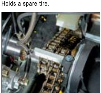
Chain Lubrication System Provides 5 seconds of chain lubricant every 15 minutes or 1 hour of run time. 1 litre (1 quart) oil reservoir.