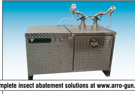
Mozzie Electric Foggers