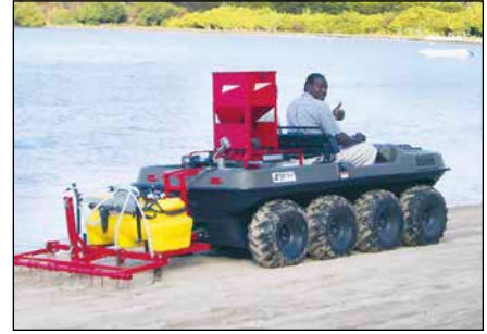
Salt Water Resistant