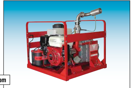
Mozzie Engine Driven Foggers

Complete insect abatement solutions at www.arro-gun.com