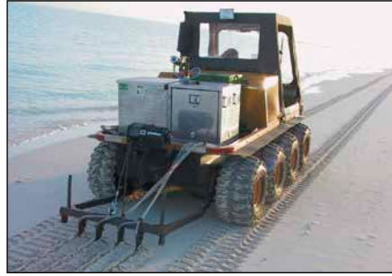
Sand Fly Prevention