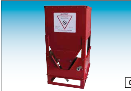
Mozzie Larvicide Applicators