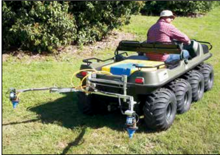
Low Ground Pressure