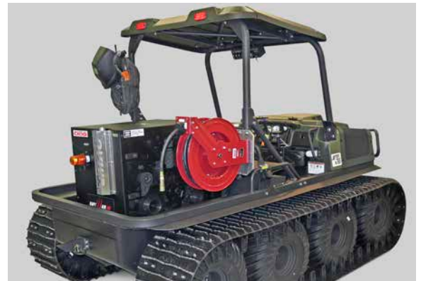
VMAC Multifunction Unit on ARGO 8x8 XTD.