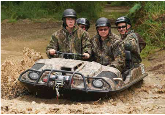
The new ARGO 8x8 FRONTIER EFI features a Kohler Command Pro engine with electronic fuel injection.