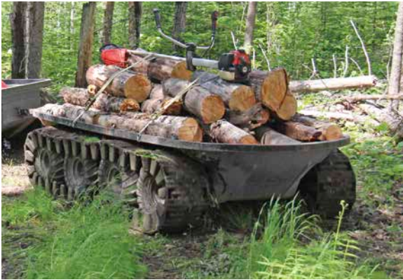
NEW ARGO 8x8 trailer for hauling material or transporting additional equipment.