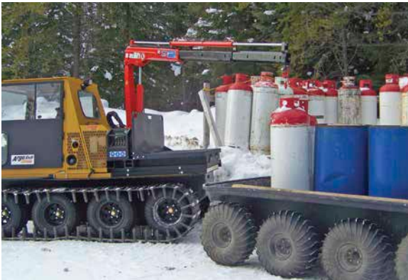
ARGO 8x8 Centaur equipped with Maxilift crane and flat bed loading an ARGO 8 wheel trailer.