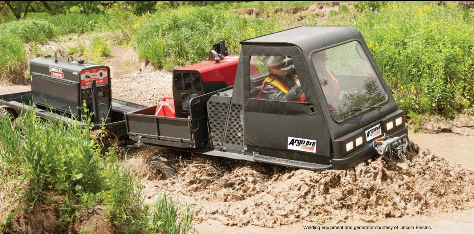
Welding equipment and generator courtesy of Lincoln Electric.