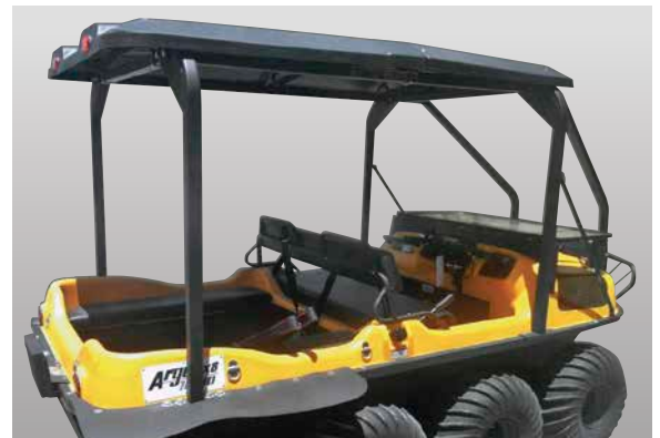
NEW ARGO hardtop provides protection against the elements and greater operator comfort (mounts onto ARGO ROPS).