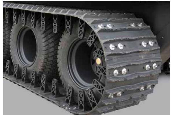
NEW tracks featuring HD UHMW-PE guides, HD hinge lacing, reinforced rims and high impact resistant turf tires.

The HD tracks are available as tandem or quad options also featuring HD hinge lacing, aluminum backing washers and reinforced rims.