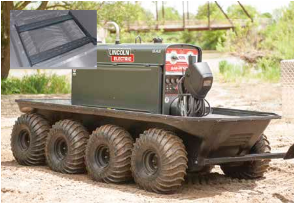
Lincoln Electric welding equipment attached to an 8 wheel ARGO amphibious trailer via the Universal Mounting System.